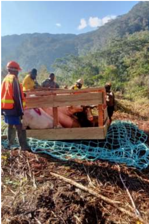
Helicopter delivery of livestock arriving in Kampung Aroanop in Tembagapura District is received by a deputation from the local community.