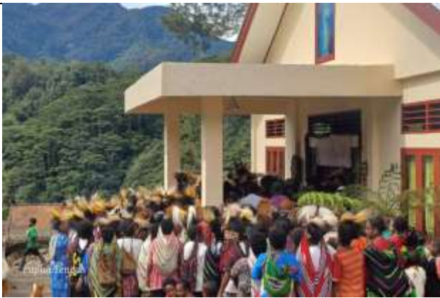
The community joyfully celebrating inauguration of Ainggigi Church in Kampung Aroanop