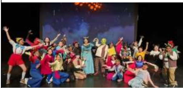
All performers of Shrek the Musical 2024 appearing onstage.