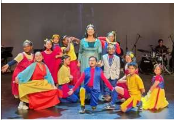
Dodgers: Fairy Tale Creatures in the Broadway Mainstage Jakarta 2024 – Songs and Scene from Shrek performance.