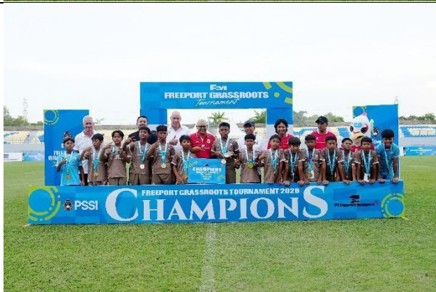
SSB Gressia claims the U-12 championship title at the Freeport Grassroots Tournament 2026.