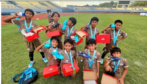
SSB Gressia U-12 players pose with the football boots distributed to all participants of the Freeport Grassroots Tournament 2026 in Gresik — a total of 300 pairs.