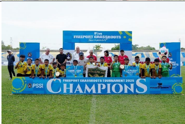
SSB Nusa Gemilang claims the U-10 championship title at the Freeport Grassroots Tournament 2026.