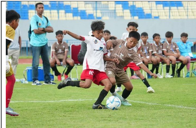
Ball-contesting action between Peganden FC and SSB Gressia players in the U-12 category final of the Freeport Grassroots Tournament 2026.